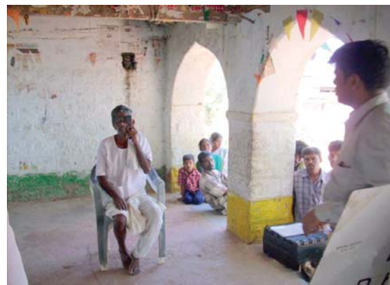
Distance Visual Acuity assessment using multiple pinhole occluder