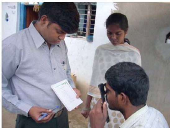
Near Vision Assessment