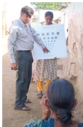
Distance Visual Acuity assessment