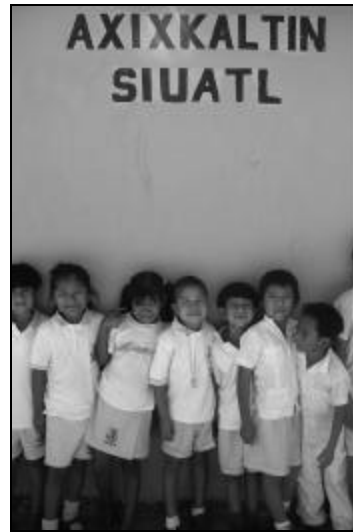
Street children who speak 4 different indigenous languages, not Spanish, wait in line for eye exams at The Netza School.

Today, Martin is still carrying the banner for VOSH in Mexico. Using the training she obtained in both the 2004 clinic in Zihuatanjeo and another clinic in Peru, she has trained a corps of twenty volunteers to screen all the native children in the Netzahualcoyotl ("Netza") School for Indigenous Children, plus twenty teachers and staff. Using the school's lunchroom and kindergarten as a clinic, over 350 free acuity tests were given over several days for the city's neediest children, ages 5 to 14.