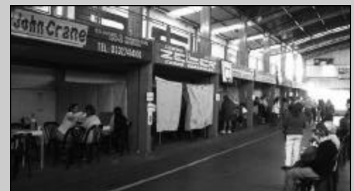
ABOVE: ODs at work in a gymnasium in Quilmes, Argentina. Left: Prescreening a patient

who were referred to Argentinian ophthalmologists for service.